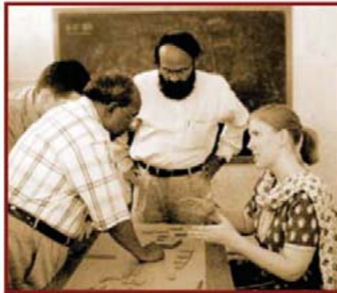
Discussing the proposed designs