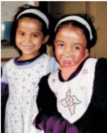
Children from the orphanage