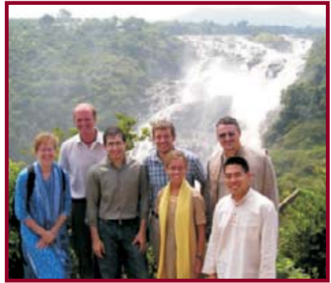
The eMi 2 team at "Bluff" waterfalls

Our eMi 2 team answered R---'s request for help in evaluating and proposing improvements to the existing water and sanitation systems on campus. On this first of two project trips, we worked hard to complete a survey map of the 17.7 acre property and everything in it. We tested flowrates throughout the water distribution and irrigation systems and evaluated the sanitation systems. As we worked, prayed, and discussed the needs of the ministry, it became apparent that we need to return with more than a civil engineering team. There are several new ministry efforts planned for the next 5 years and Kollegal Girls' Home is only one facet of that. R---